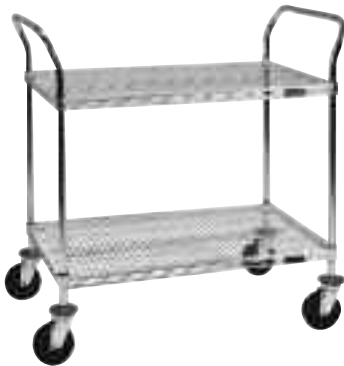
Utility Cart Constructed with Accessories