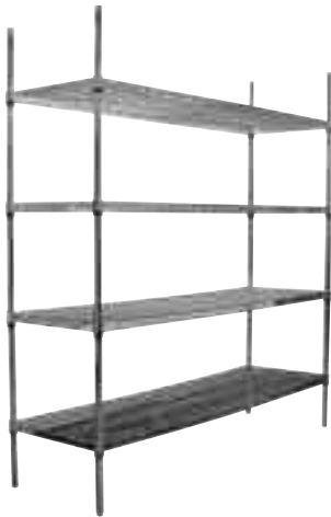
Chrome Wire Shelves and Posts