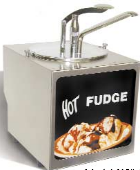
Model H50-P (Warmer w/Pump)

Compact in design, these units save valuable counter space. The lighted panel along with colorful graphics will surely put focus on your merchandise and stimulate sales.