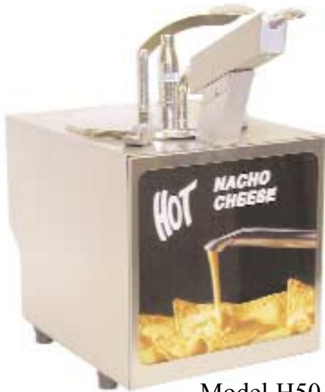
Model H50-HS (Warmer w/Heated Spout)

Each unit comes complete with an on-off switch, a lighted panel, attractive graphics, and 6 ft. cord and plug for easy installation. Powered by a powerful 400 watt wrap around heating element, it provides evenly distributed heat to the entire unit. Cecilware's Hot Condiment Dispensers are an exceptional value for your everyday foodservice operation.