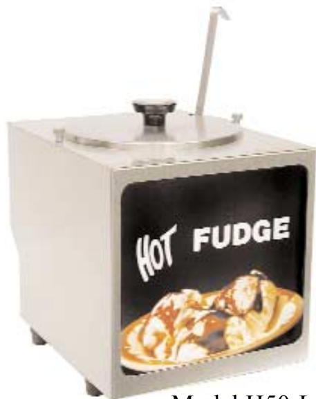
Model H50-L (Warmer w/Ladle)